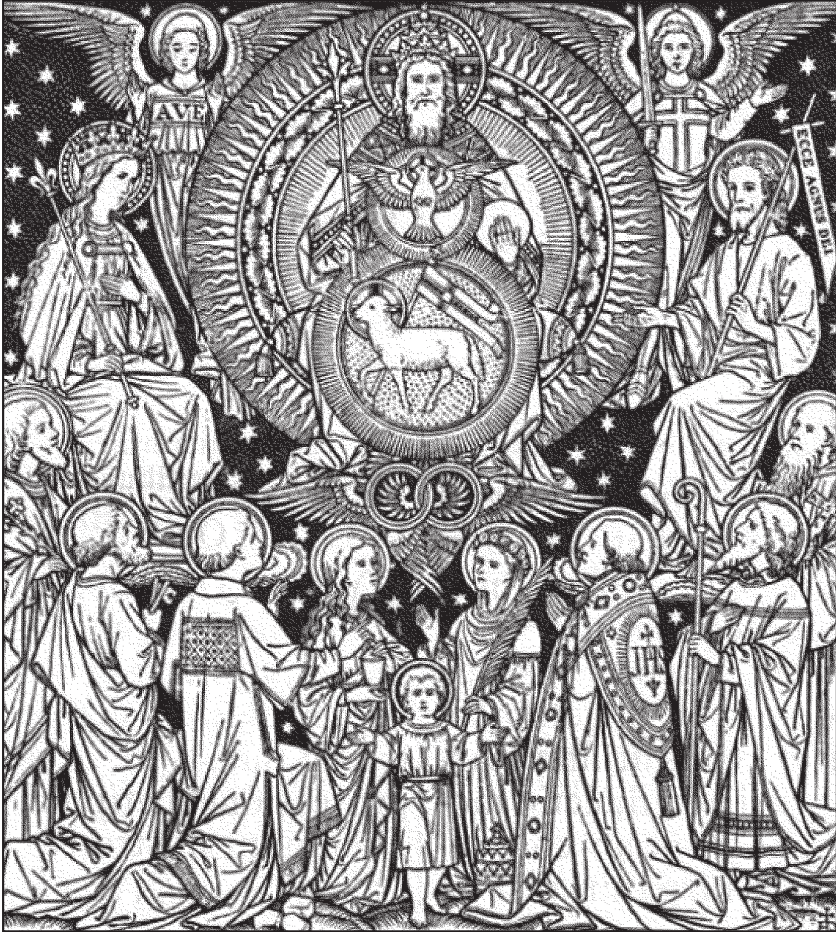
Christ enthroned with saints of heaven German woodcut, c. 1600, artist unknown