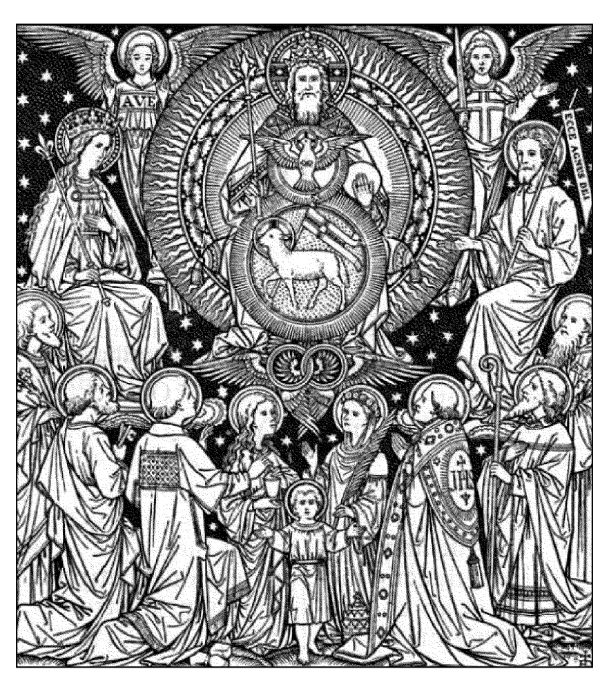
Christ Enthroned with Saints of Heaven German woodcut, c. 1600, artist unknown