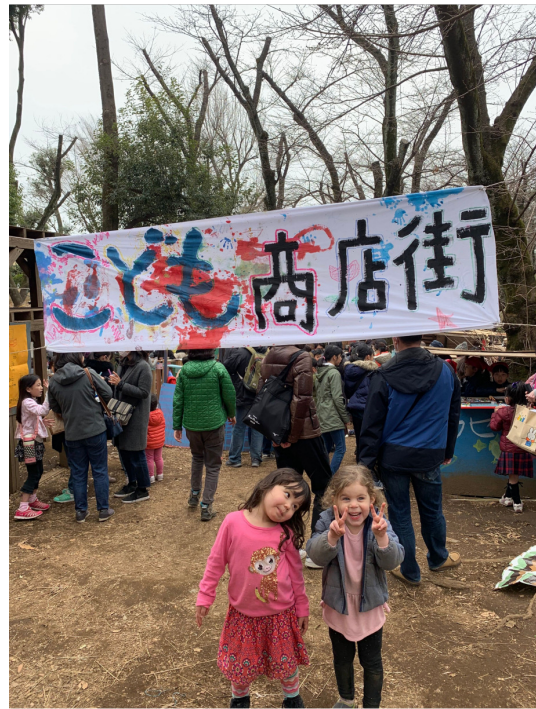
Local school kids built make-shift stands and sold everything from hair accessories to slime to minestrone soup.