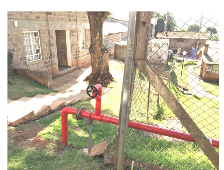
Fire extinguishers have been installed at residential buildings.